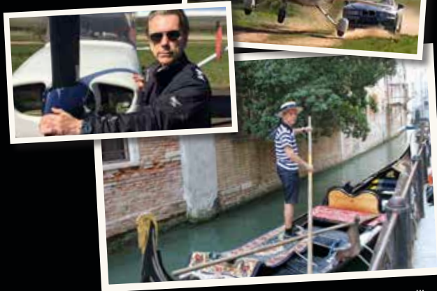
A full-sized Gondola from Venice (apparently just like the one that Roger Moore used in Moonraker).

NEWS! at the Bond Museum The aircraft Cessna 172